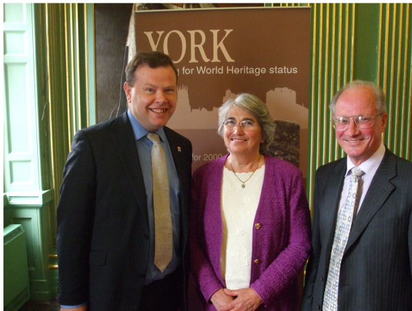
World Heritage Status Bid Launch 10 th June, Mansion House

The Executive has supported the application for the historic city centre and its underground archeological deposits to be included in a bid for World Heritage Status. An application was made to the Government for the 11 th June deadline.