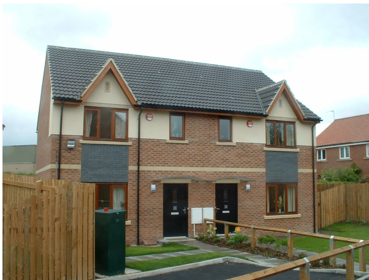
New high quality home in Morrill Close in partnership with Yorkshire Housing (official opening 10 th May 2010)

Like many former railway employees in the city who had worked at Main HQ I have been into see the Cedar Court Grand Hotel which has been fitted out to five star standard. It hosted the meeting of the Economic Forum on 10 th June.