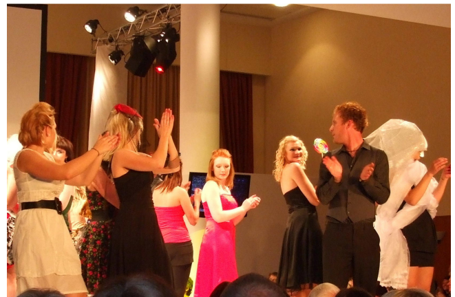
'Choose to Re-use Fashion Show', York Racecourse 28 th May – demonstration of fashion from local charity shops, and from local new designers