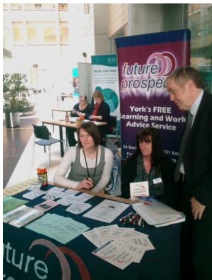
Future Prospects at a York College hosted even for Jarvis employees

An international conference on moving towards more sustainable forms of transport "Car Free Cities" was held in York between 28 th and 1 st July and recognised the work that has been done to reduce dependence on the car in the city.