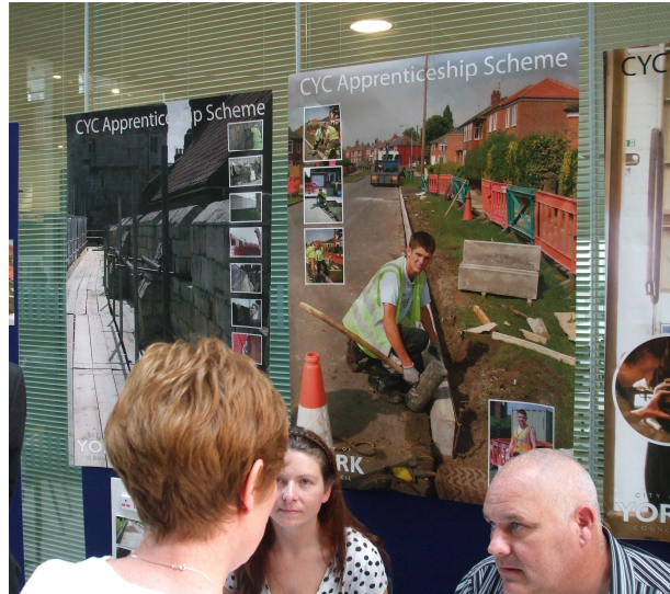
Promoting City of York Council Apprenticeship Scheme

Each Executive member has been involved with the Year 2 refresh strategy and will be working to ensure that these deliver a real difference to the lives and opportunities of people who live in the city.