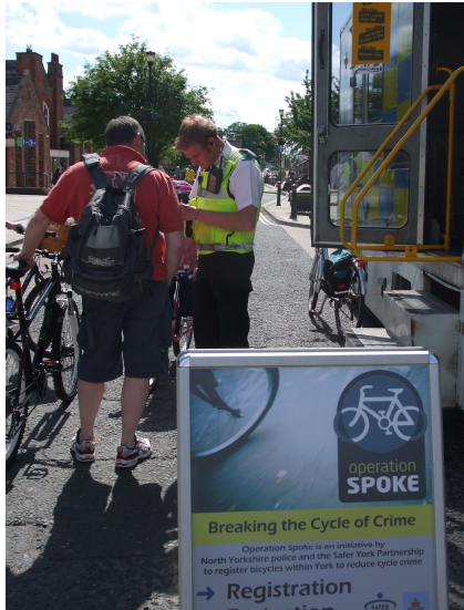
Operation Spoke – Cycling Tagging